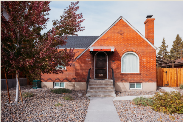
The two-bedroom, one bathroom bungalow is fully furnished and is a separate property next door to VGH.

Some veterans need extra help overcoming complex mental health challenges and the high cost of rent. The two nonprofits are working together to provide housing and services that best prepare veterans for independent living and a happy life after service.