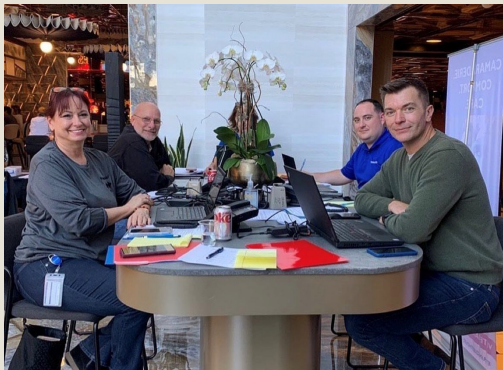
Panasonic volunteers at the Radiothon phone lines, the airwaves were abuzz!