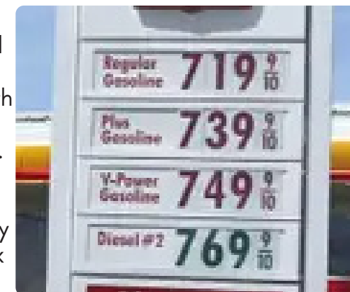
Bridgeport, Calif., Where many guests travel through on their way to VGH (May 12, 2022)