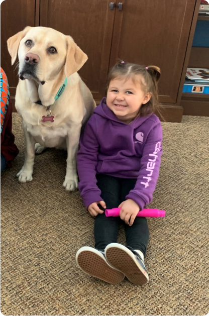
House dog Ella was a comforting companion to the family in distress.

Your support ensures that veterans are not alone during their final hours and that families have a peaceful place to rest when the unthinkable happens.