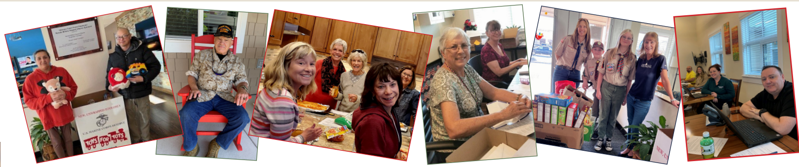
Thank you to the all the volunteers, dinner hosts, community partners, and YOU who have supported VGH throughout the year!

Recognizing this service gap and its adverse impact on health, Veterans Guest House is committed to raising the $15,000 needed for transportation in the new year to help the 800 rural and local veterans lacking medical transportation. No veteran should be faced with forgoing care—join us in our effort to ease transportation barriers for guests as they seek access to vital medical treatment.